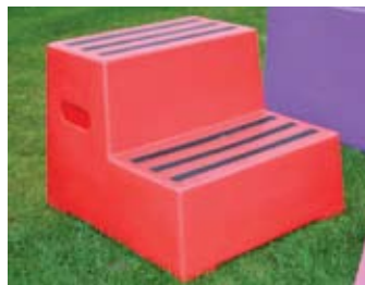
Premium 2 Step • CL333 Height: 41.5cm Weight: 10kg