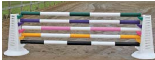
2. Pro-Jump 5 Band Poles • CL255

Made from the same great material as all our other poles but with just three bands of colour. Great for beginners as the larger middle section gives them more to aim at! Comes with removable end cap so for a bit more weight you can add sand. Available in a variety of colours. Size 3m x 10cm