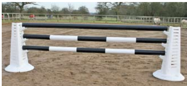
5. Pair Pro-Jump maxi's, 2 x 5 band poles, 1 x heavy weight pole, 3 pairs cups • CL304