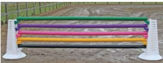
3. Pro-Jump Heavyweight Pole • CL256

Five band, two colour poles made from 4mm thick coloured polyethylene, not PVC, won't crack or split even in low temperatures. They come with a removable end cap, so if you want to have a slightly heavier pole, just remove the end and fill with sand. Available in Red/White, Blue/White, Green/White, Black/White, Yellow/White, Pink/White, Green/Blue or Red/Yellow. Size: 3m x 10cm