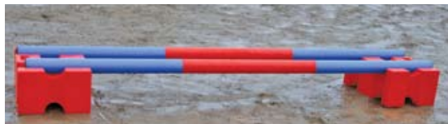
2. Pair Parallel blocks & 2 x 3 band poles • CL301