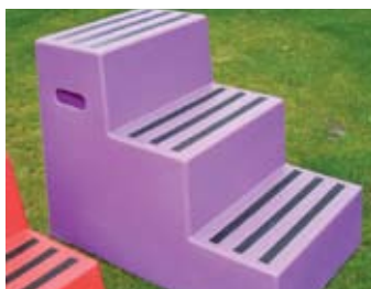
Premium 3 Step • CL334 Height: 62cm Weight: 15kg