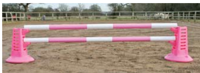
4. Pair Pro-Jump mini's, 2 x 5 band poles & 2 pairs cups • CL303