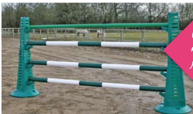
7. Pair pro-jump maxi's, pair pro-jump extensions, 3 x 5 band poles, 1 x heavy weight pole, 4 x pairs cups • CL306

Everything you need to make a complete jump – just buy, set up & jump...!