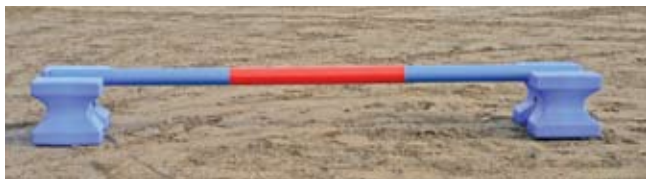
1. Pair Pro-Jump Blocks & 1 x 3 band pole • CL300