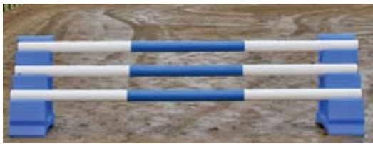
1. Pro-Jump 3 Band Poles • CL288

Made from the same great material as all our other poles but with just three bands of colour. Great for beginners as the larger middle section gives them more to aim at! Comes with removable end cap so for a bit more weight you can add sand. Available in a variety of colours. Size 3m x 10cm