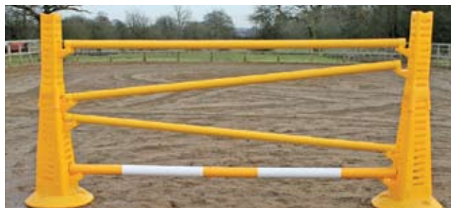
6. Pro-Jump Economy stand – pair of Maxi's, pair of extensions, 3 x heavy weight poles, 1 x 5 band pole, 4 x pairs cups • CL305