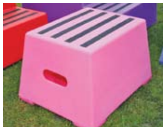
Premium 1 Step • CL332 Height: 30cm Weight: 5kg

Our heavy duty Premium range of blocks are accredited to the BS EN 14183:2003E British & European safety standard meaning that we guarantee that they will take up to 260kg. Ideal for use in riding schools and large livery yards, each block has hand holes and is fitted with abrasive anti-slip strips for sure footing.