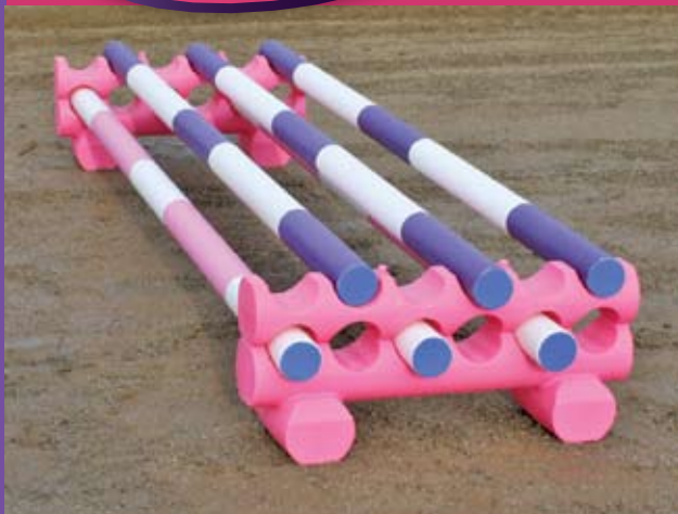
6. Pole Tidy • CL245

The ingenious design means you can stack your poles up but always be able to take out which ever colour you want – they just pull out from one end. Can be used with either plastic or wooden poles.