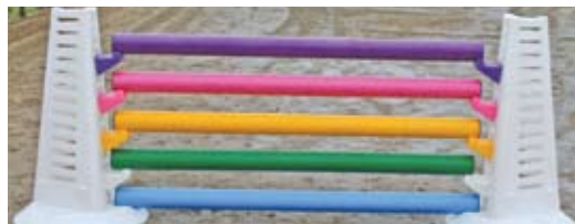
4. Pro-Jump Stile Pole • CL248

Made in the same way as the lightweight, but with a solid wooden pole in the centre to provide extra weight. Great for top poles or when your horse needs to learn to pick his feet up. Available in Solid colour only - Red, Blue, Green, Yellow, Pink, Purple, White, Brown or Black. Size 3m x 10cm