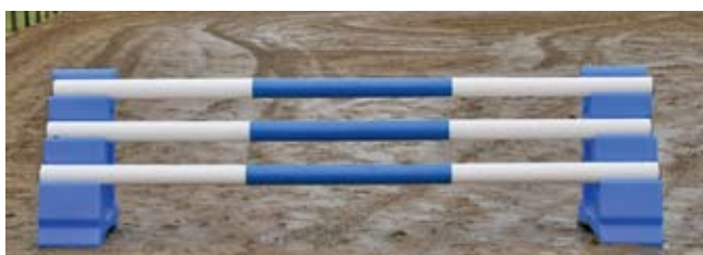
3. Pair Sloping blocks & 3 x 3 band poles • CL302