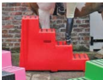
Premium 4 Step • CL335 Height: 82cm Weight: 20kg