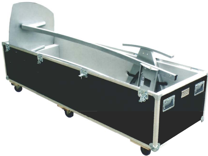
«« 2.2 metre long Flight case manufactured for Red Bee Media (BBC) to house two Plasma screen stands.

When designing flight cases we always ensure that our customers are fully involved at every stage, and we guarantee to offer you the best possible professional advice and field sales support whenever required.