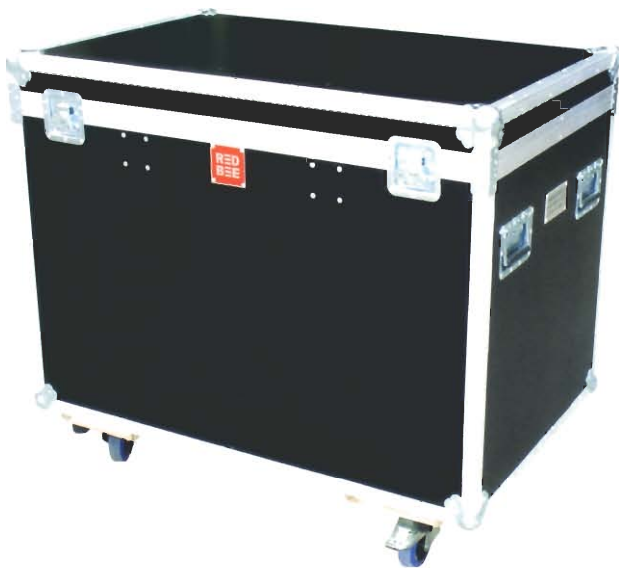
«« Flight case manufactured for Red Bee Media (BBC) to house cables.